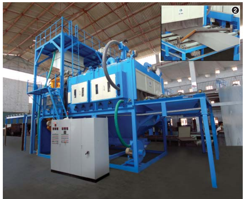
Airless tunnel type shot blasting machine