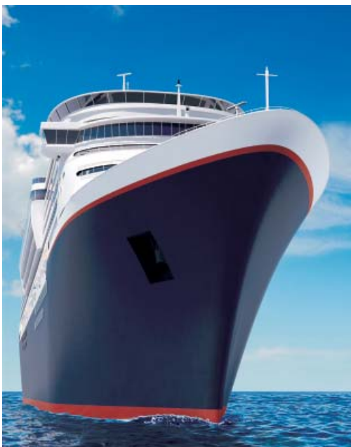
MECSHOT recently supplied preservation line for shipyard

tunnel and enters into the blasting chamber. The blast wheel stations are located strategically around the cabinet to give the plates the right exposure. The plates are arranged one-by-one or, in the case of small sections, in parallel rows on the roller conveyor. A roller conveyor system feeds the work pieces continuously through the blasting chamber and before the work pieces leave the chamber, the blowing fan will remove left over shots from the surface. The travel speed can be continuously adjusted by VFD. The shot blasted plates come out from the chamber to get painted in an online painting chamber. The media is stored in a tank fitted at the top of the blasting chamber and combined with the shot separator. The media is automatically fed into the wheels and is collected in