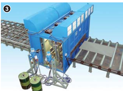
Paint spray booth with X manipulator

The current trends in surface preparation machines show high demand for good quality surface bonds, operator friendly machines and a good esthetic look of the product. In recent years the demand for abrasive blasting has become a mandatory requirement in all walks of life. Today Mec Shot is standing on the verge of becoming one of the biggest providers in the Asian territory of complete solutions in the shot blasting & shot peening field. The fluctuation in the current global industrial scenario is the main challenge faced by the surface preparation market. Mec Shot has dedicated people who have worked together for a long time and are responsible for success. Mec Shot in particular has transferred extensive knowledge of surface preparation & shot peening by way of conducting various workshops.