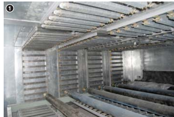
Pre heating chamber

The blasting machine is engineered for automatic blasting of plates & structures. The work piece travels on the entry & exit side roller conveyors. The work piece passes through an inward